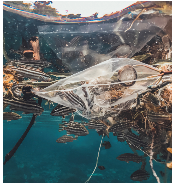
Green Century's shareholder advocacy reduces plastic pollution to protect ocean wildlife and vital ecosystems.